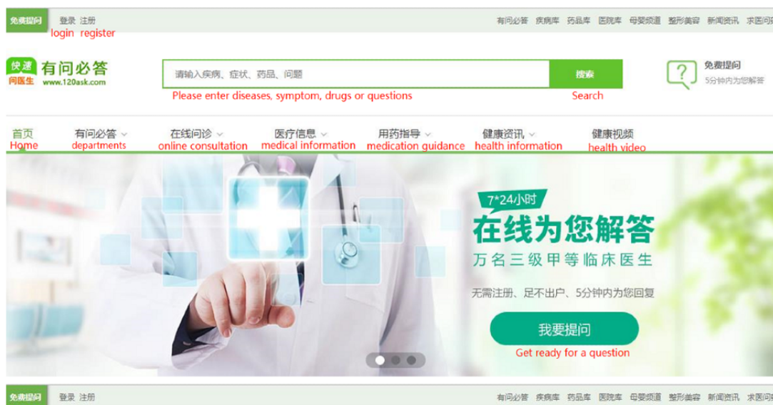
Figure 2. The 120ask website.

We chose the 120ask website to conduct our empirical study for the following reasons. First, the website has the history of all the consultation records saved that would help patients seek health information about similar diseases (Figure 4). Second, consultation records this website are public, which provides the patient with basic information such as gender and age. Third, the doctor's information is available on the website. Fourth, it has a large number of registered users, which enables this website to process data that are under private protection. The above features make the 120ask website a fundamentally useful website for our study.